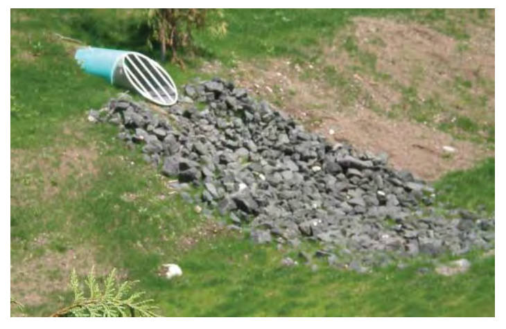
This energy dissipator is in good condition.

Energy dissipators slow the flow of water to prevent erosion at inlet pipes.