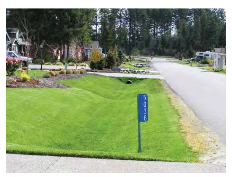
A well-maintained swale

Swales are wide, shallow ditches with gently-sloping sides and a flat bottom where stormwater runoff either infiltrates into the ground or flows to another destination. Swales are usually planted with grass to filter out sediment and pollution. Swales should never be filled in, not even with pipes, gravel or decorative rocks (and, especially not beauty bark). Some swales feature rock dams to intentionally slow the flow of water into a stormwater pond (see "Rock Baffle and Dam").