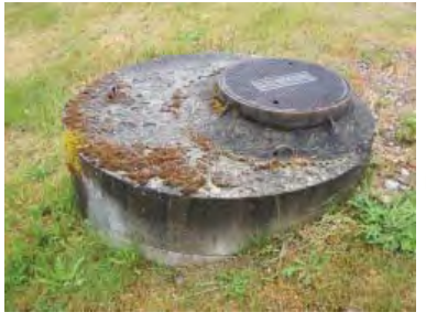
A typical metering device

ACTION ITEMS: Remove vegetation and debris. Hire a professional for repairs.