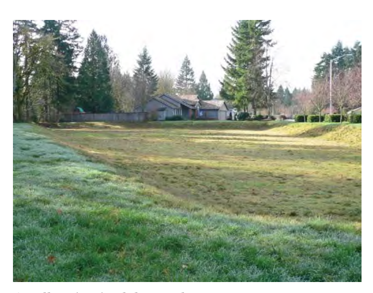
A well-maintained dry pond.

The ponds are usually seeded with grass to absorb pollutants before the water infiltrates into the ground, which helps protect drinking water aquifers.