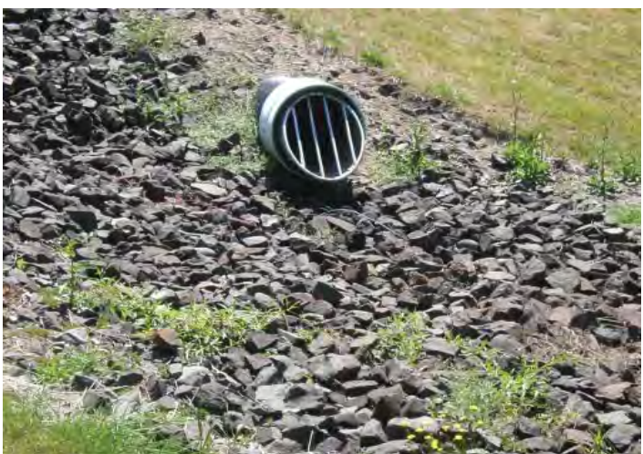
A well-maintained inlet pipe

Inlet pipes send water into swales and stormwater ponds. The water that flows through the inlet pipe should fall on a splash pad made of rip rap (see "Energy Dissipator"). The trash rack shown here prevents animals and children from entering the pipe.