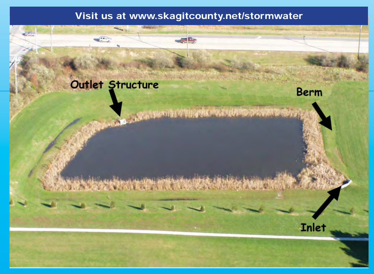
A stormwater pond is a type of stormwater facility.

This publication provides simple tips for maintaining stormwater facilities. For further assistance, contact: Lori Wight: loriw@co.skagit.wa.us Michael See: michaels@co.skagit.wa.us or call 336-9400.