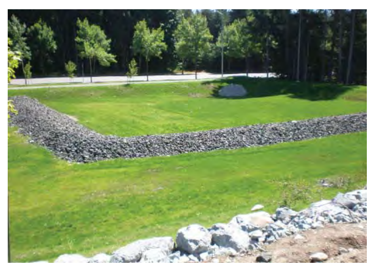
This well-maintained rock baffle slows the flow of water from one area of a stormwater pond to another area.

Rock baffles slow or redirect the flow of water.