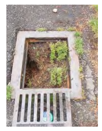
Catch basin clogged with