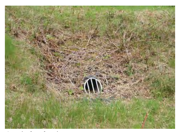
A typical outlet pipe

ACTION ITEMS: Keep the trash rack and outlet area free of sediment, trash and problem vegetation. Hire a professional if the structure is damaged.