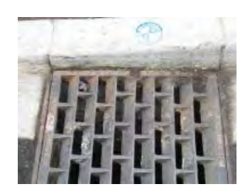
Functioning catch basin

ACTION ITEMS: Clean litter and leaves from catch basin grates. If the street is privately owned, hire a professional to remove sediment buildup in the sump. Keep pet waste out of streets and gutters.