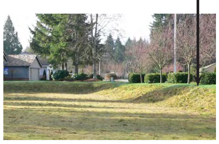
A well-vegetated berm

A berm is a sloping, earthen sidewall of a stormwater pond, including the flat, top surface of the sidewall.