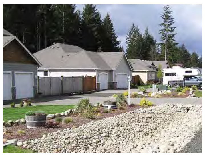
This swale, designed for grass, should not have been filled with rock. Homeowners who alter stormwater swales may be required to restore swales to their original design.

ACTION ITEMS: Mow the swale and remove grass clippings and leaves. Do not use herbicides or pesticides. Aerate soils to preserve percolation rate.