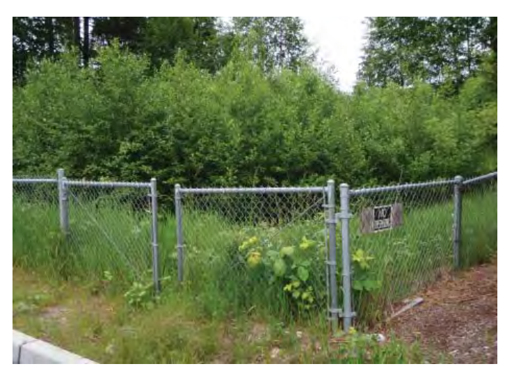
Alders and blackberry bushes have taken over this dry pond, hindering the infiltration of water.

Wet Ponds: Wet ponds are are often lined with clay or plastic to allow the water to pool. Pollutants settle to the bottom of the standing water, or are absorbed by vegetation in the pond. The cleaner water on top is then conveyed into a dry pond (where it seeps into the soil) or into a nearby body of water.