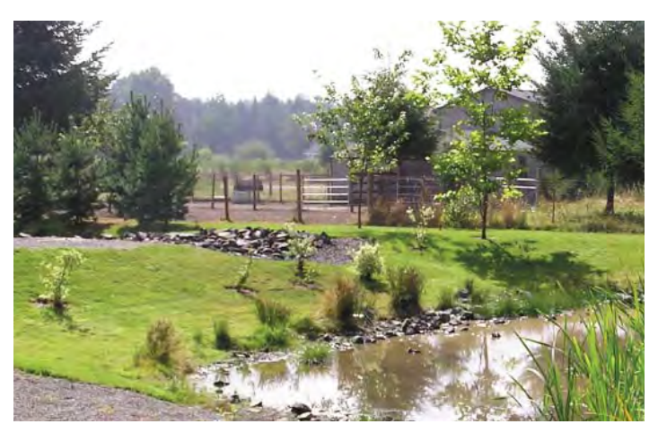
A well-maintained wet pond.

Wet Ponds: Wet ponds are are often lined with clay or plastic to allow the water to pool. Pollutants settle to the bottom of the standing water, or are absorbed by vegetation in the pond. The cleaner water on top is then conveyed into a dry pond (where it seeps into the soil) or into a nearby body of water.