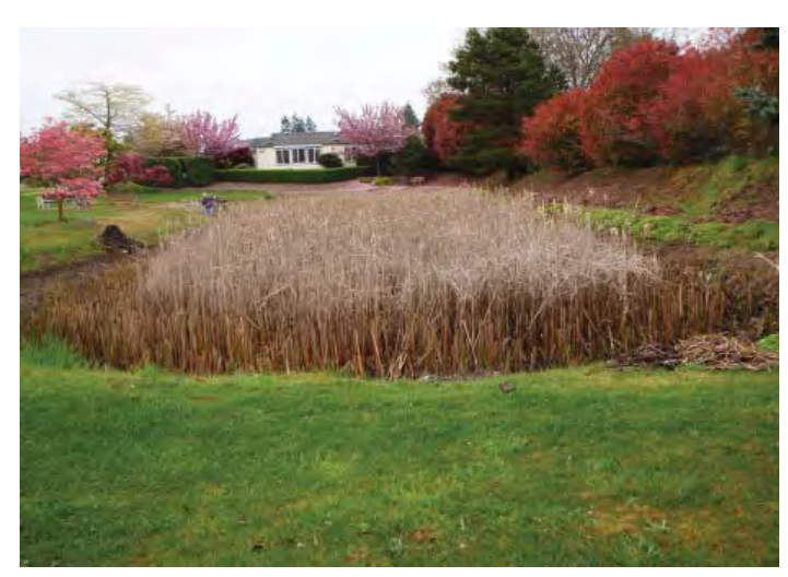
This wet pond is overgrown with cattails.

ACTION ITEMS: Maintain stormwater pond parts as described in the following pages. Also, remove trash, yard debris and problem vegetation. Check your pond before and after the rainy season (October and May).