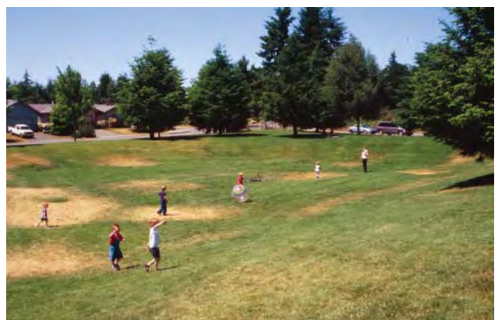
Dry ponds are often used for light or casual recreation during the summer.

Your stormwater pond might be located in your back yard or, if you live in a housing development, down the street or on nearby property.