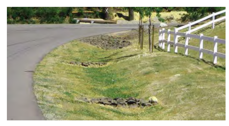
The rock check dams in this swale intentionally slow the flow of water. Rock check dams are beneficial, unlike swales that have been filled with rock by homeowners.

ACTION ITEMS: Replace scattered rocks and remove weeds and excessive sediment.