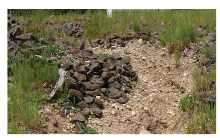
Erosion damages this dissipator.

ACTION ITEMS: Replace scattered rocks and remove weeds and excessive sediment.