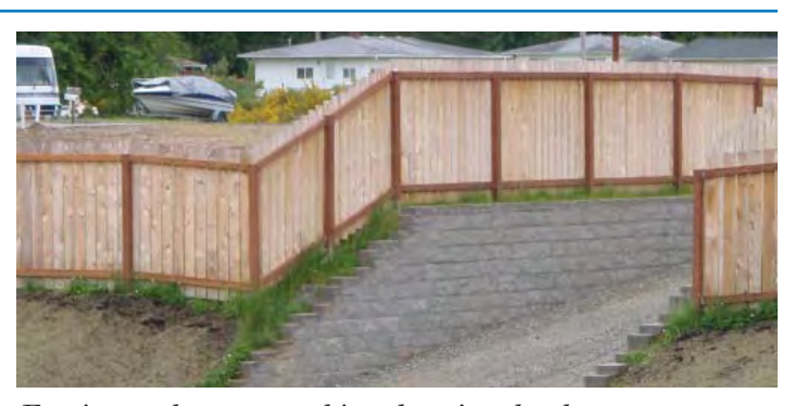
Fencing and access road in a housing development.

ACTION ITEMS: Keep fences in good repair. Keep access road clear and prune landscaped trees and shrubs along the road.