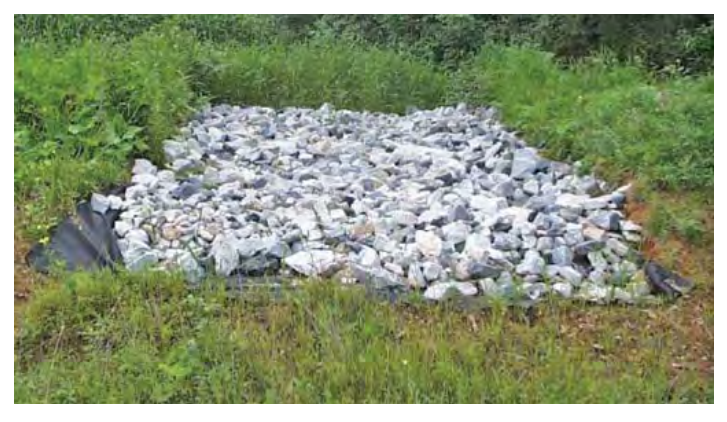
A rip rap spillway.

ACTION ITEMS: Keep free of trees and other vegetation. Remove trash and yard debris.