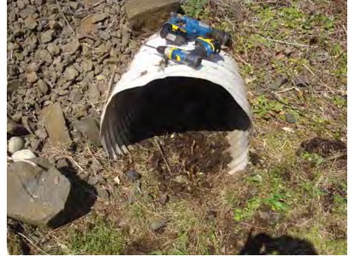
This inlet lacks a trash rack and is loaded with sediment.

ACTION ITEMS: Keep inlet structures free of trash and debris, and remove sediment. Also remove plants, such as alder and willow, that tend to grow near the end of the pipe. Hire a professional to fix broken racks.